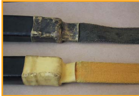
Figure 5 Two similar products with unknown history – the top webbing is heavily soiled