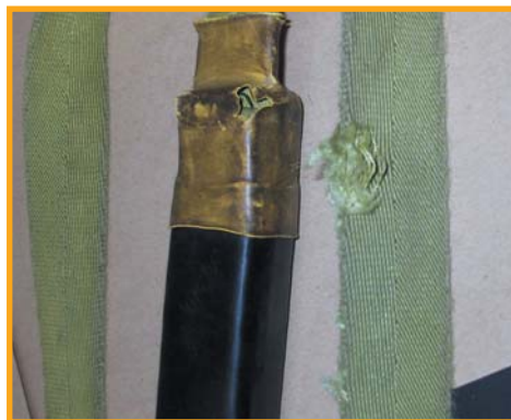
Figure 1 Damaged webbing and protector to energy absorber

The following photographs show lanyards that have been withdrawn because of damage suffered during use.