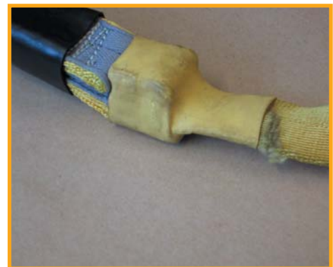
Figure 2 Abrasion damage adjacent to energy absorber: displaced protective sleeve over energy absorber