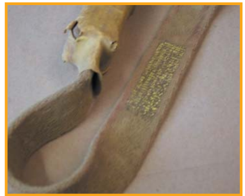
Figure 8 Missing label: damage to protective sleeve over energy absorber