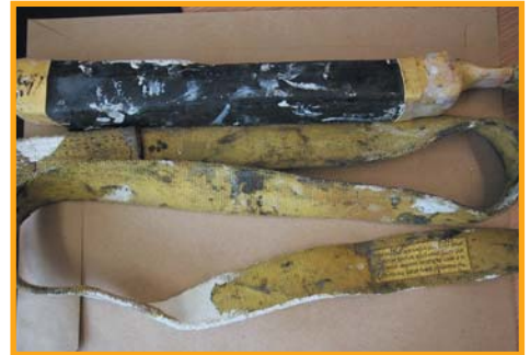
Figure 6 Heavy paint contamination to webbing