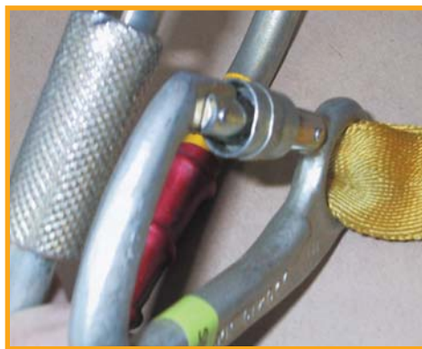
Figure 7 Damaged gate on karabiner